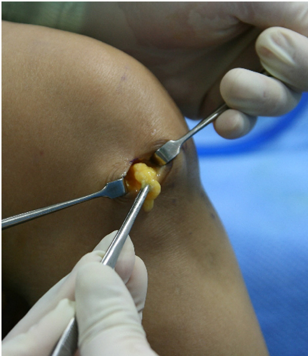
Fig 1. Adipose synovium was harvested from the infrapatellar fat pad by extension of the arthroscopic lateral portal site.

home to apply cold therapy/ice to the affected area for pain.